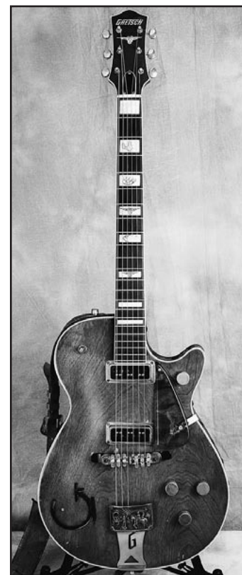
1955 Gretsch Roundup (6130)