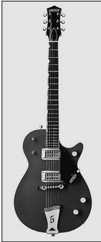
Gretsch Jet Firebird Reissue